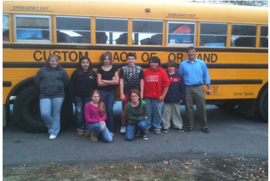
REACH Bus Stuffers

Thank you once again to the South Portland Music Boosters, for all of their support thus far in the year. Their next meeting is Tuesday, January 19 th at Memorial Middle School. Additionally, the March meeting will be held on March 9 th in the Mahoney Cafeteria. The meetings begin at 7:00 p.m. The music parents are also busy at work every Saturday night raising money to help support our program. If you are interested in this great group, check out their website at www.southportlandmusicboosters.org . This informative website contains photos, audio clips, and important information about music in our city.